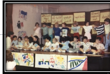
Above: Year end concert in 1985; each year we still keep these traditions alive at our annual June concert.